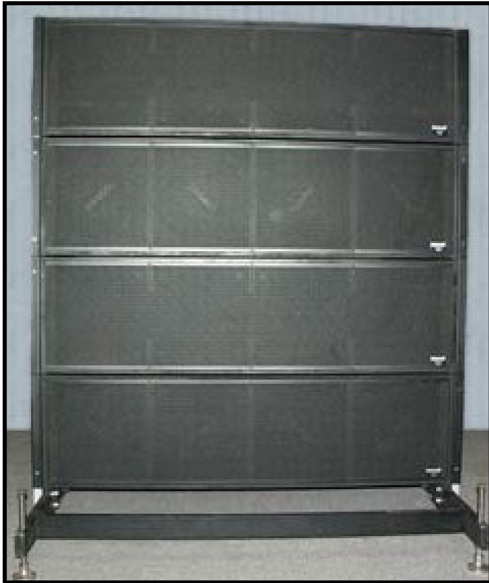
4 x SB412C Cardioid Woofer Surface Array